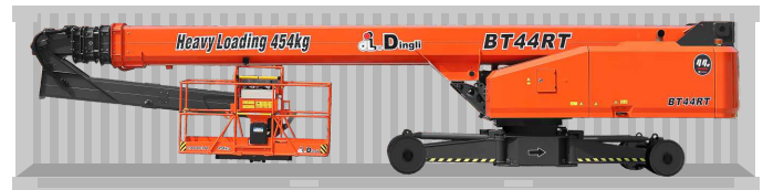
Standard Container Transport